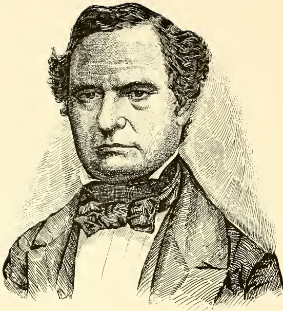
GEORGE D. PRENTICE.